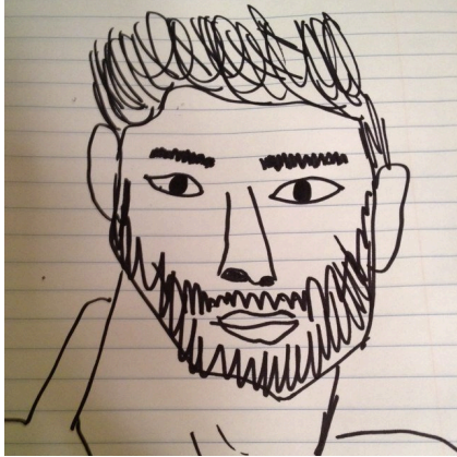
Not much effort here. Images like this would receive a low score.

Please know that effort is fairly obvious with this assignment. This image below was obviously drawn freehand and probably completed in a very short time. If your drawing level is here as a free hand artist, you'd best be using instructional books' videos, or an artist to help you. This image shows very little effort and if you turn in images of this quality, your grade will reflect your lack of time and thought spent.